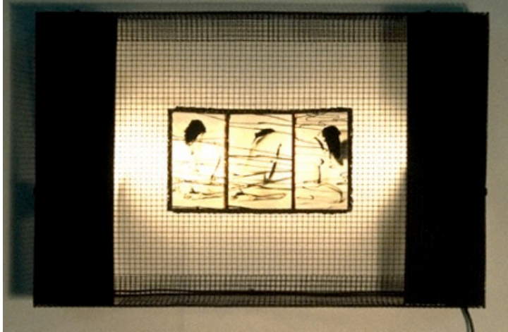
Leta Evaskus, Untitled

All photos are property of the artists, available as separate Jpegs upon request.