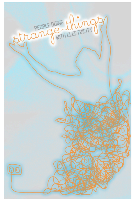
Graphic for "Strange Things" flyer and poster by Dasein Studios

http://www.dorkbot.org/dorkbotsea/events-pdstwe2.shtml for an overview of our last exhibit including a list of artists, and http://www.paddfam.com/pdstweii_pix.html for pictures.